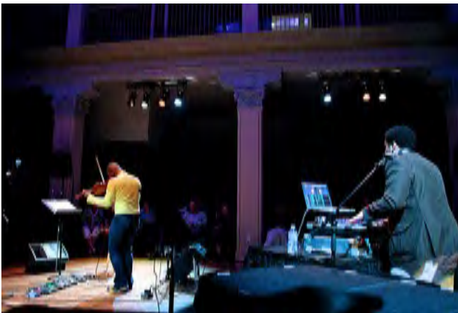
Music (purple mood lighting from programmable, skylight LEDs)