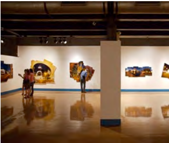
California Museum of Photography, installation view, Ground floor