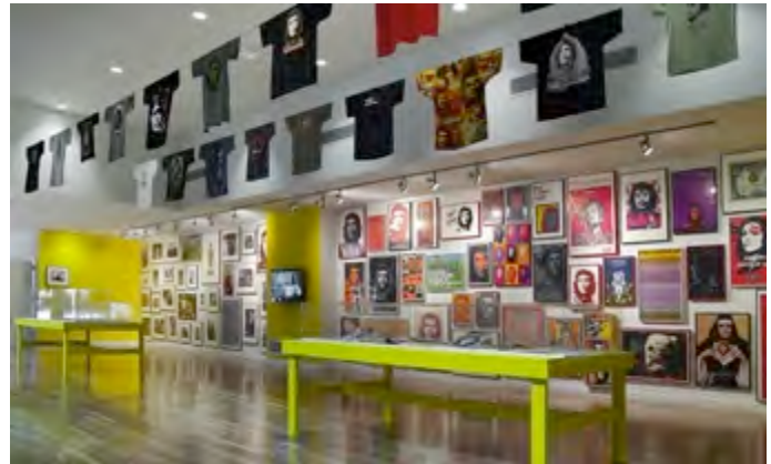
North Atrium Gallery, Che! Redux exhibition, installation view