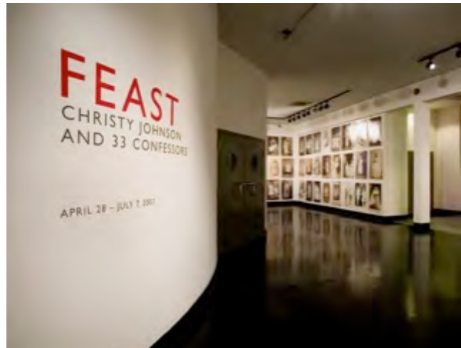
California Museum of Photography, installation view, third floor