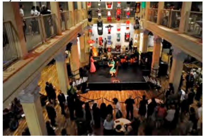
Theatre (stage with performance in front of hanging sculpture)