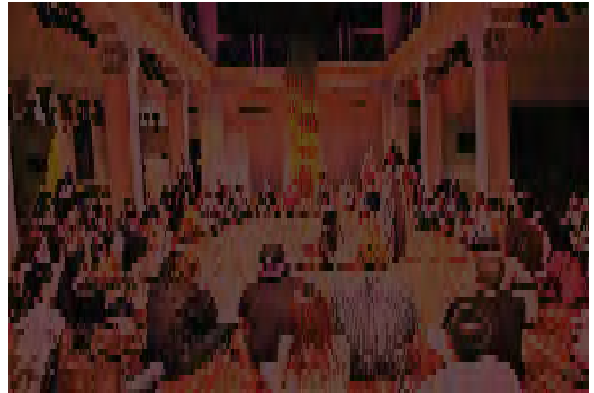
Dance (audiences can sit in the round, proscenium style, in chairs, on the floor)