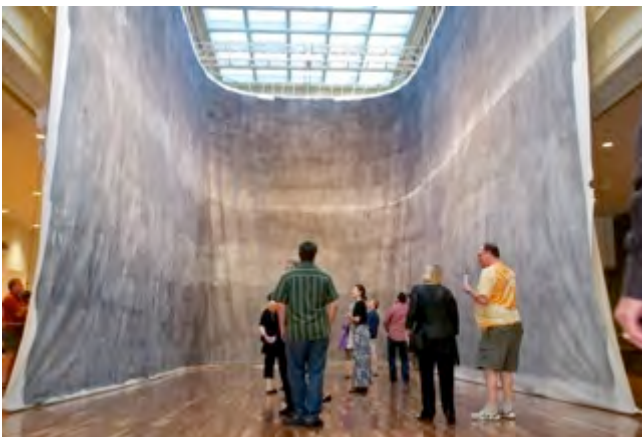
Exhibition (large-scale art installations in the atrium)

The Culver Atrium is utilized for exhibitions, performances, and the occasional facility rental. The space is an expansive, wood-floored area under a magnificent 35-foot high naturally illuminated clerestory monitor. Programmable, theatrical lighting lines the perimeter of the space. There are four trusses that span the ceiling for hanging artwork, theatre flats, etc. Each can hold up to 4000 lbs. Additionally, there are programmable LED lights behind the skylight in which the tenor of the space can be altered with color. The interior area between the Atrium columns is approximately 22 x 75 feet or 1650 square feet. Seating can be proscenium style, in the round, include chairs or on the floor. The Atrium is a multi-disciplinary space where there can be simultaneous activities, such as exhibitions open to the public during gallery hours in the day and then performances in the evening.