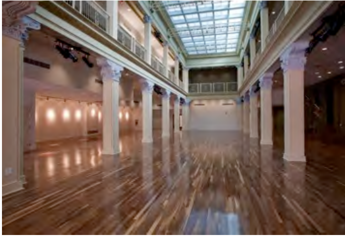
Center Atrium with trusses, and North Atrium Gallery to left

Four trusses span the center atrium. Each can hold approximately four thousand pounds. They are ideal for hanging sculptural work and theatre flats. Culver has a scissor lift for reaching the trusses. Such projects require a lot of planning as a wood track has to be laid down for the scissor lift in order to protect the permanent wood floor. Additionally, only staff trained on the use of the scissor lift may use it.