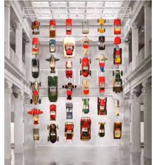
Exhibition installation hanging from rear truss