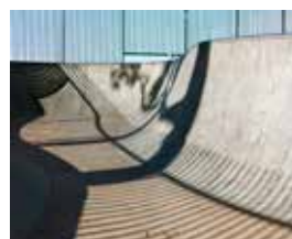
Concrete Vessel 27, 2018