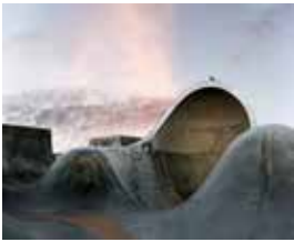
Concrete Vessel 138, 2018 60 × 75 in. Archival pigment print