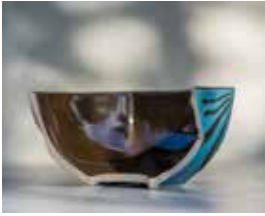
Broken Vessel 76, 2018 48 × 60 in. Archival pigment print