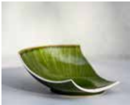
Broken Vessel 79, 2018 8 × 10 in. Archival pigment print