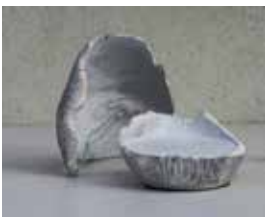
Broken Vessel 123, 2018