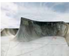
Concrete Vessel 2, 2018 36 × 45 in. Archival pigment print