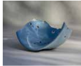
Broken Vessel 74, 2018