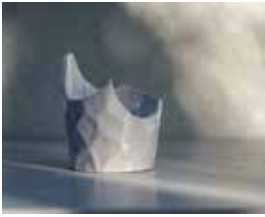
Broken Vessel 108, 2018 8 × 10 in. Archival pigment print