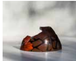
Broken Vessel 29, 2018