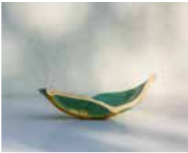
Broken Vessel 85, 2018