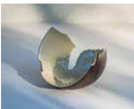
Broken Vessel 104, 2018