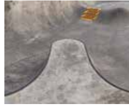
Concrete Vessel 112, 2018 48 × 60 in. Archival pigment print