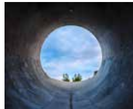
Concrete Vessel 75, 2018 60 × 75 in. Archival pigment print