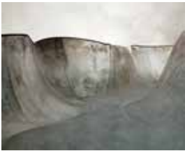
Concrete Vessel 63, 2018 48 × 60 in. Archival pigment print