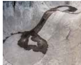
Concrete Vessel 95, 2018 24 1/2 × 29 5/8 in. Archival pigment print