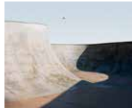
Concrete Vessel 26, 2018