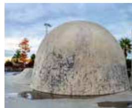
Concrete Vessel 89, 2018 16 × 20 in. Archival pigment print