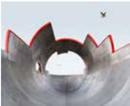
Concrete Vessel 55, 2012