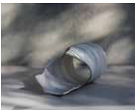
Broken Vessel 46, 2018 16 × 20 in. Archival pigment print