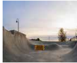
Concrete Vessel 109, 2018