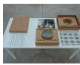
Empty Vessel: A limited edition box which contains a poster, a concrete bowl, a print, and a poem 2019 Mixed media (includes table)