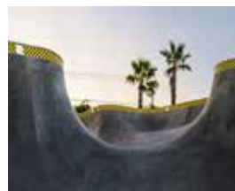
Concrete Vessel 130, 2018