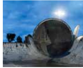
Concrete Vessel 72, 2018 8 × 10 in. Archival pigment print