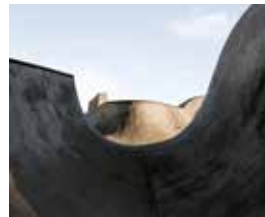
Concrete Vessel 47, 2018 48 × 60 in. Archival pigment print