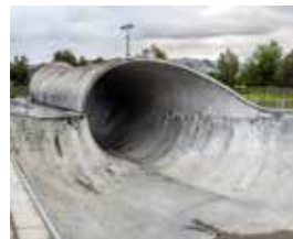
Concrete Vessel 79, 2018