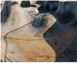
Concrete Vessel 53, 2018