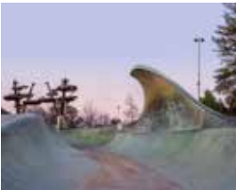
Concrete Vessel 116, 2018