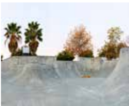
Concrete Vessel 107, 2018