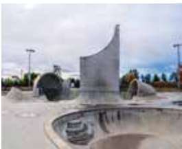
Concrete Vessel 82, 2018 36 × 45 in. Archival pigment print